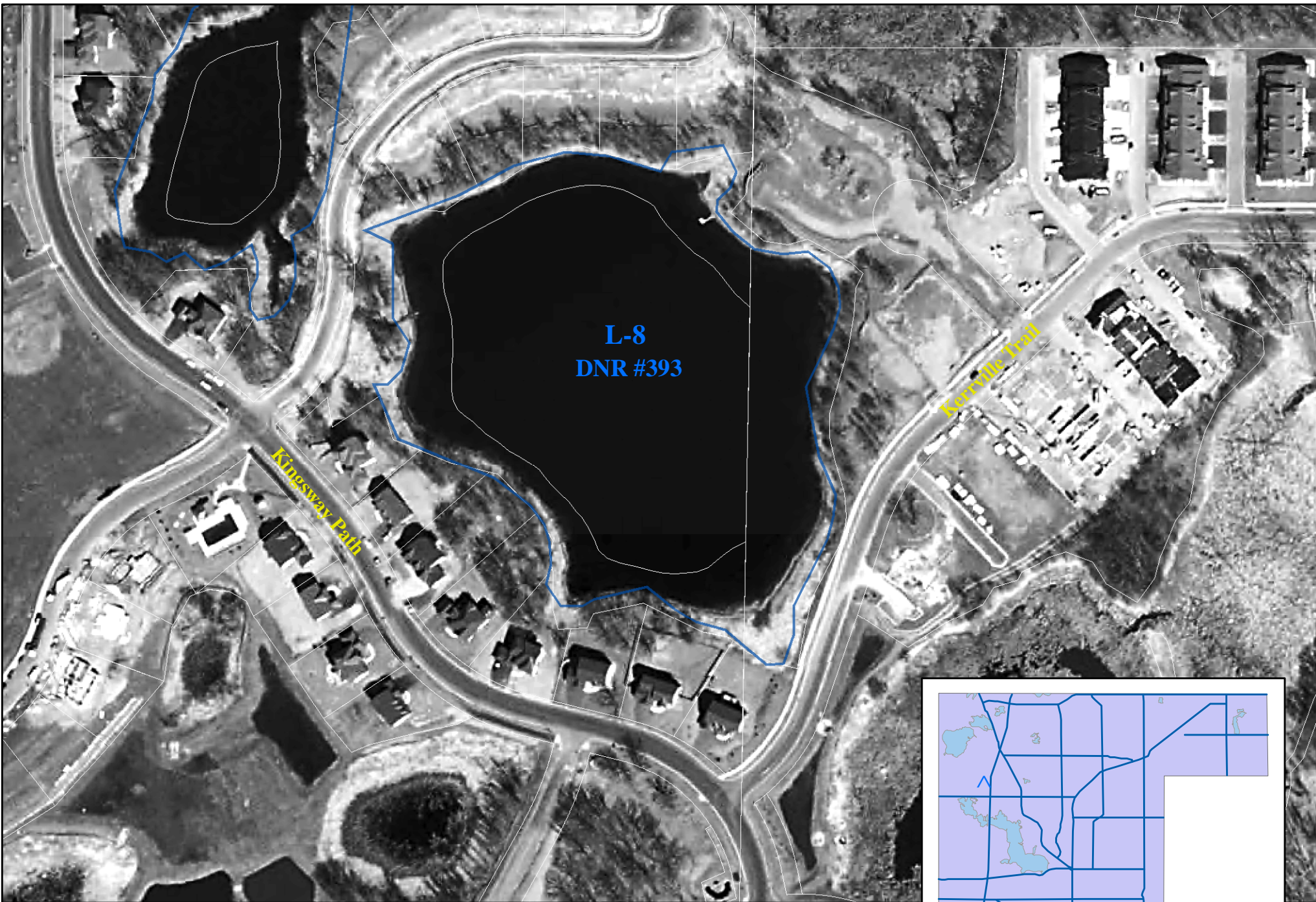
2005 Aerial Photo