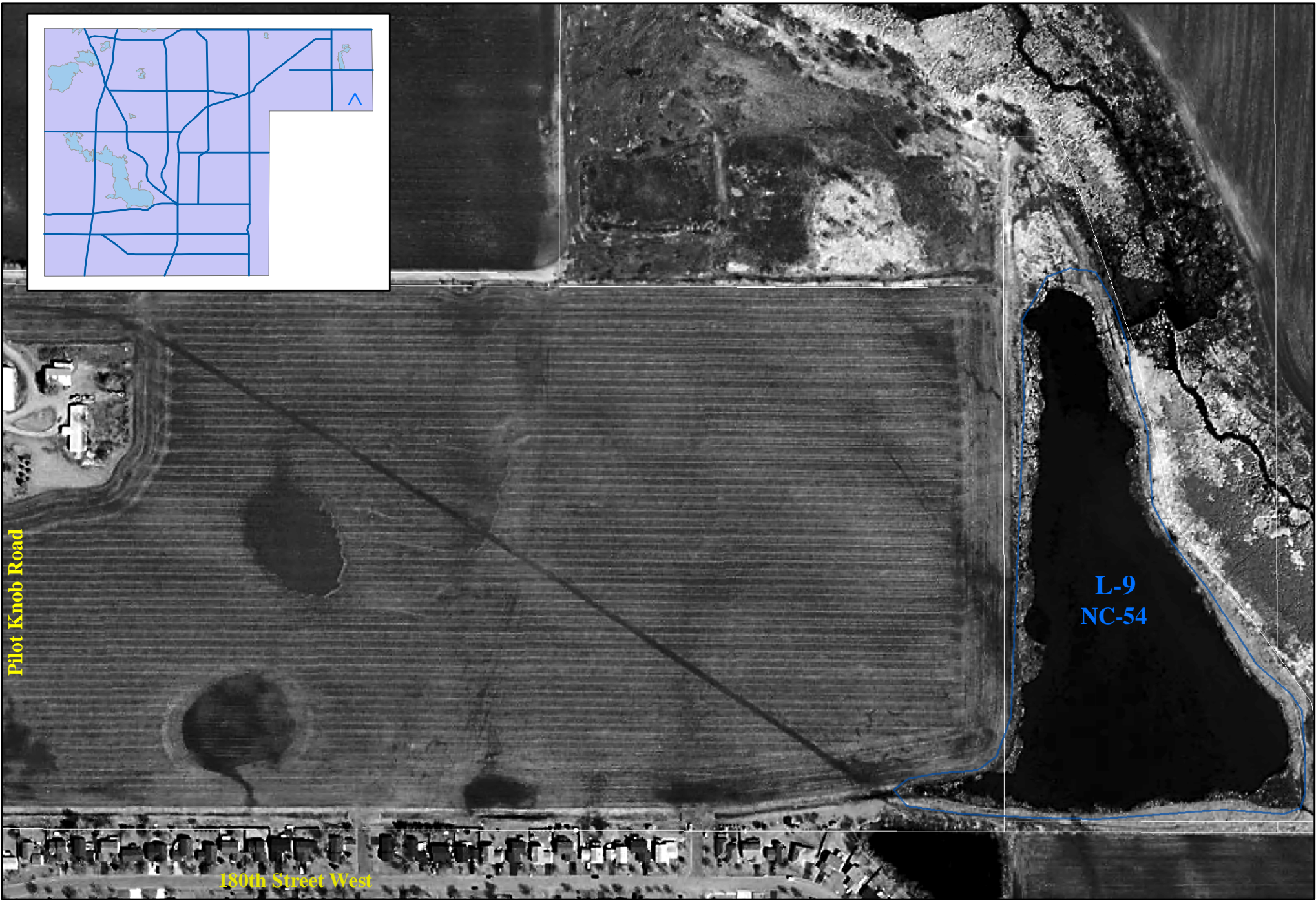
2005 Aerial Photo